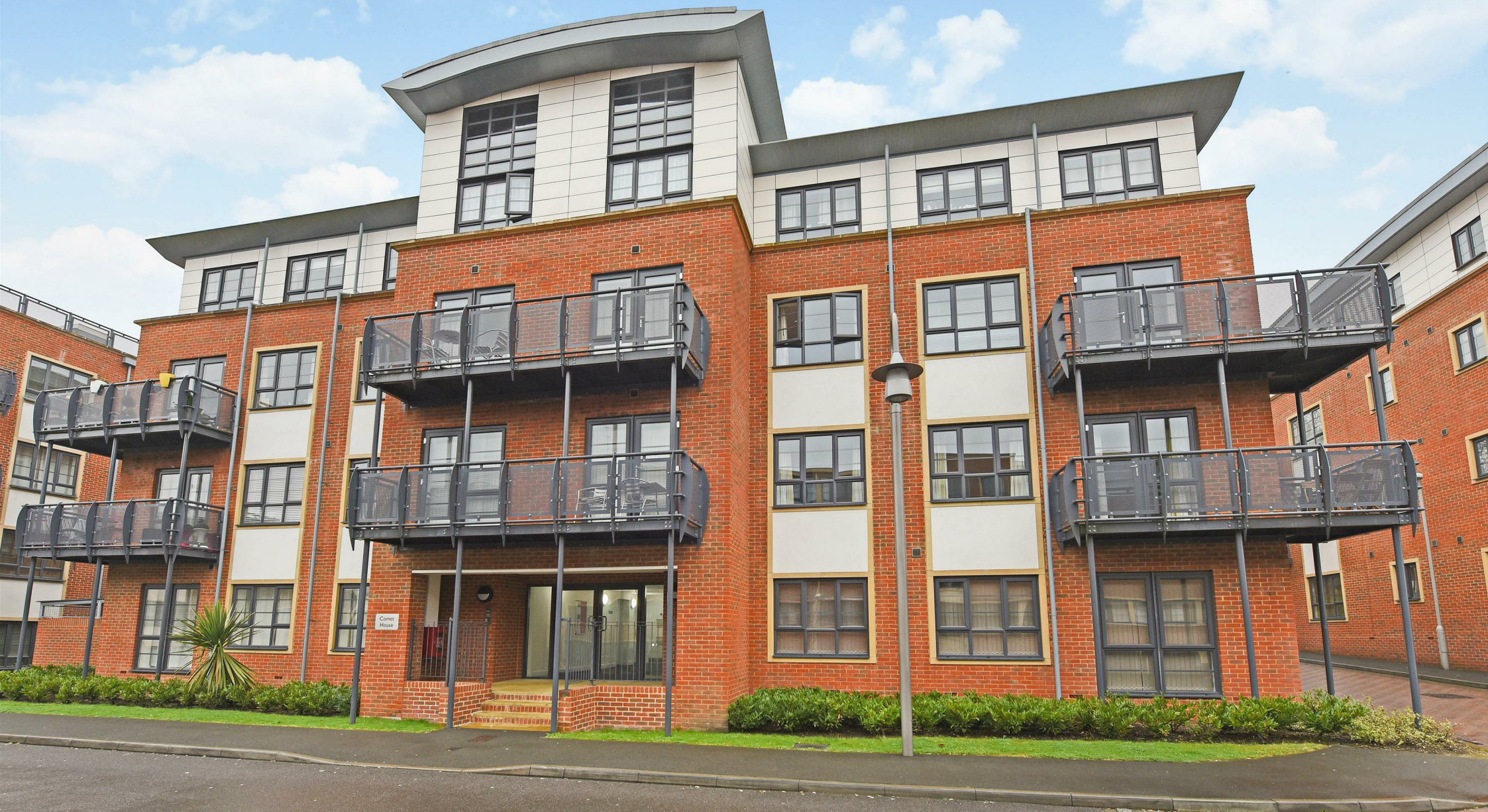
Comet House, Wallis Square